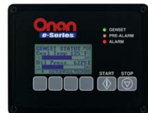
e-Series Digital Display