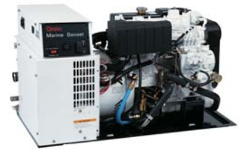
Standard Model without Sound Shield Shown.